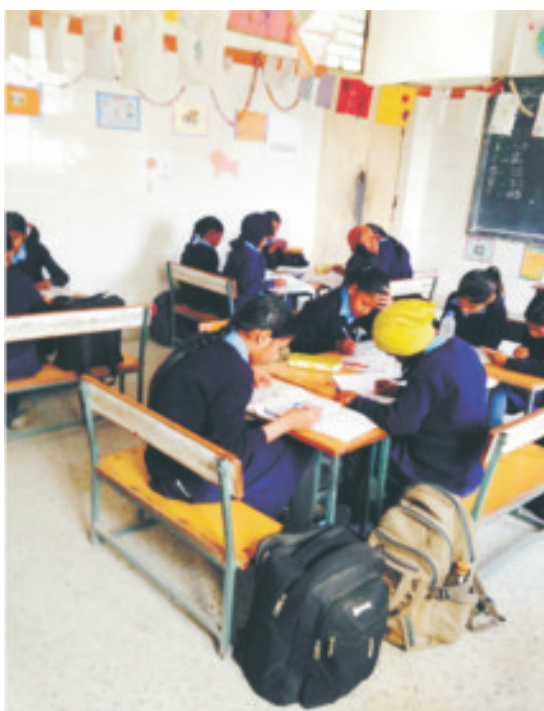
Figure 1. Students at the Nigam Pratibha Girl's School, Aya Nagar, attempting a self-evaluation exercise.

After the exercises, I wrote the answers on the blackboard. I then asked the students to compare their responses with those on the board, and identify the questions with differing responses. This was followed by a discussion around the mistakes made by them and why using words in the right tense was important. Thereafter, the students corrected their responses on their own, and exchanged their notebooks with a neighbour for a final overview.